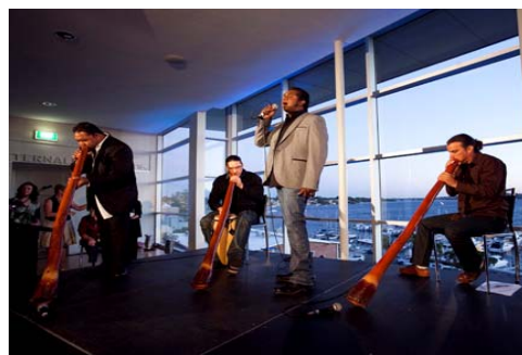
Above: The crowd were in awe. Against a most spectacular backdrop of the sun setting over Freshwater Bay, artists perform at the Bethesda Palliative Care Unit fundraiser.