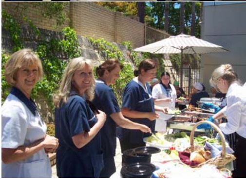
Left top: Theatre and CSSD staff enjoy the Christmas lunch shaded under an umbrella on a beautiful day.